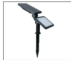
Install in lawn