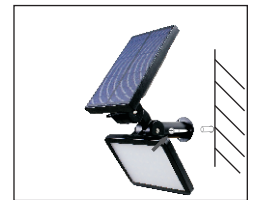
Install on wall